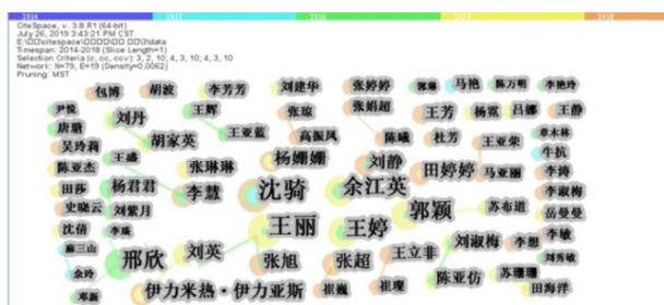
Figure 2. Visualization of the co-author network.

The co-author network is used to analyze the joint research in a certain research field. In the software interface, the node categories were respectively set to author cooperation analysis, the node threshold value was 3/2/10 ; 4/3/10 ; 4/3/10 in terms of annual frequency of appearance—and the other parameters were set to be unchanged. The CiteSpace V software was run, overlapping authors were manually eliminated.