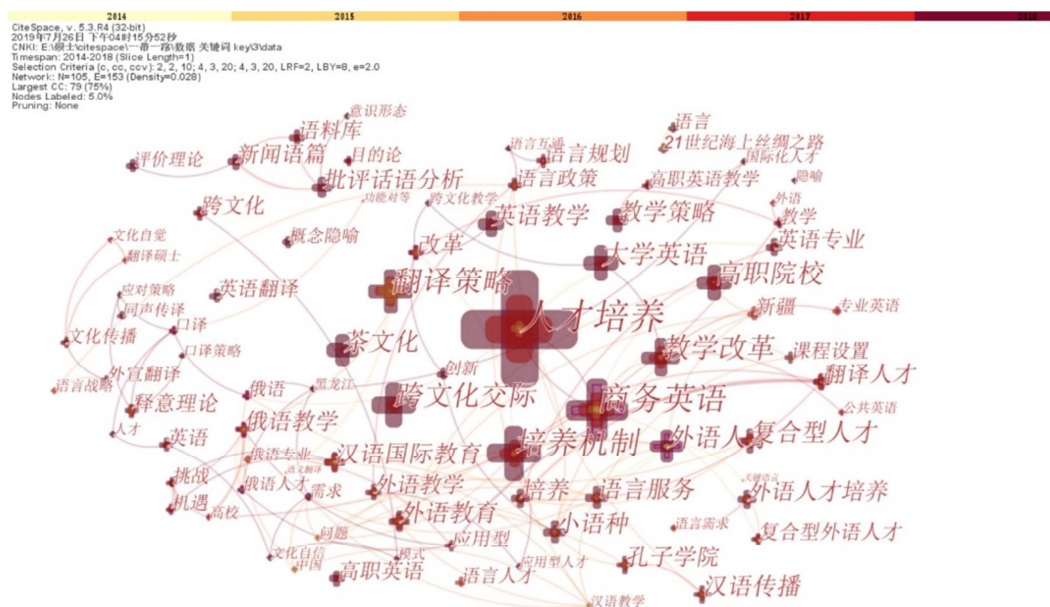
Figure 4. Visualization of keywords.

In the software interface, the node categories were respectively set to keyword cooperation analysis, the node threshold value was 2/2/10 ; 4/3/20 ; 4/3/20 in terms of annual frequency of appearance—and the other parameters were set to be unchanged. The CiteSpace V software was run to create statistics on the keywords and create a knowledge map, overlapping keywords were manually eliminated. As shown in Figure 4, the CiteSpace analysis results show a total of 105 nodes, and 153 interaction lines. When retrieving data, the search formula contains “the Belt and Road” and “Silk Road Economic Belt”, so these two nodes cannot be used as high frequency keywords.