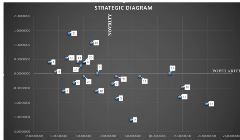
Figure 5. Strategic diagram.

According to the above calculation formula, the novelty and popularity can be calculated. Then the strategic diagram is plotted with the clustering popularity as the horizontal axis and novelty as the vertical axis, as shown in Figure 5.